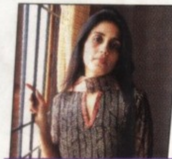
Fashion Maker on pg 4