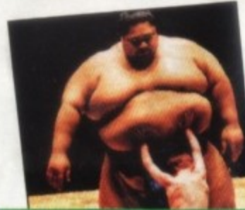
Fight obesity on pg 3