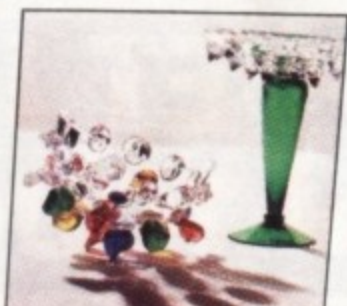
Decors on pg 7