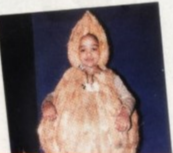
Page 5 for Kids Corner